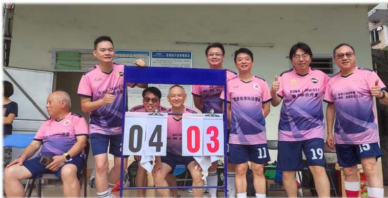
The Joint Institutions football team comprising HKJB, HKIMT, HKIE-MMNC

In the afternoon, the Joint HKIMT/HKJB/MMNC Football Team participated the Annual Friendship Football Match with GDSNAME Football Team at CSSC Huangpu Wengchong Shipyard Football Field. In a match marked by heat and shifting weather, both teams showed remarkable tenacity and teamwork, keeping the contest evenly matched throughout. The Joint HKIMT/HKJB/MMNC team held strong to claim victory with a final score of 4-3.