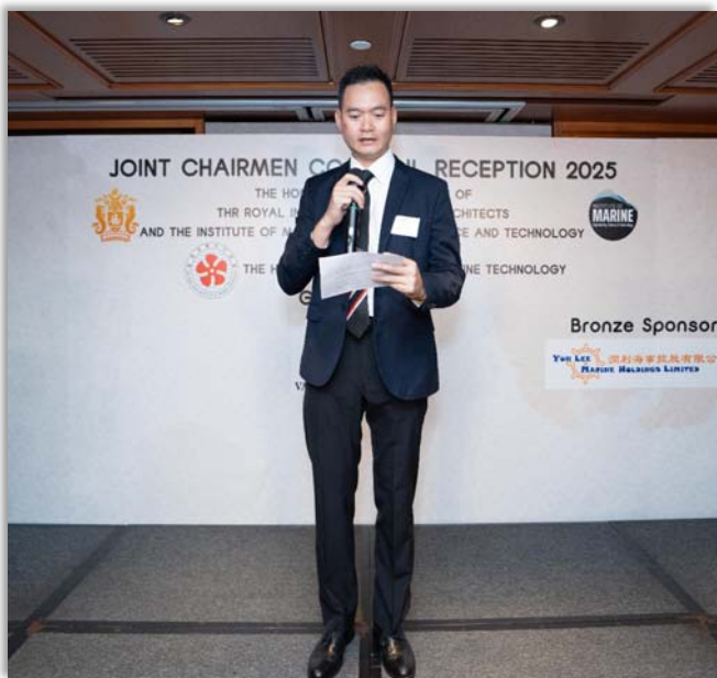
Chairmen of HKJB (Left) and HKIMT (Right) delivered the speeches