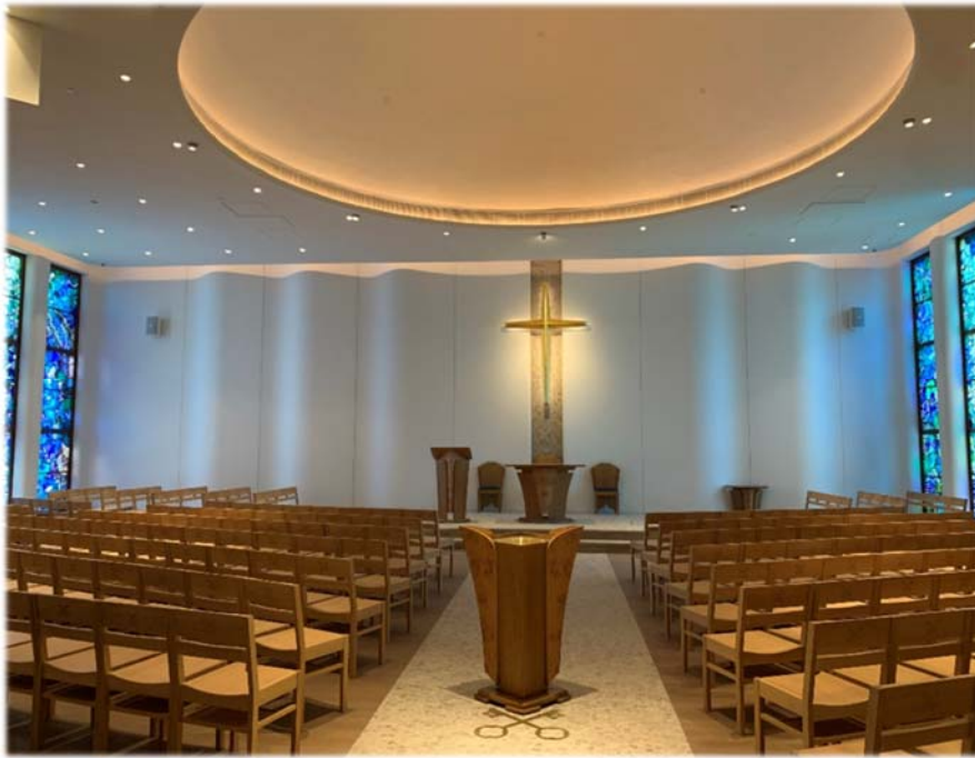
200 Seat chapel in The Mariners

Over 80 % of world trade volume is carried by sea, involving about 1.9 million seafarers. Behind then are the same number of families. Though emotional challenges of both seafarers and their loved ones on shore, physically separated from each other often for prolonged periods, are by no means small and may not have been well understood, they are for certain not alone.