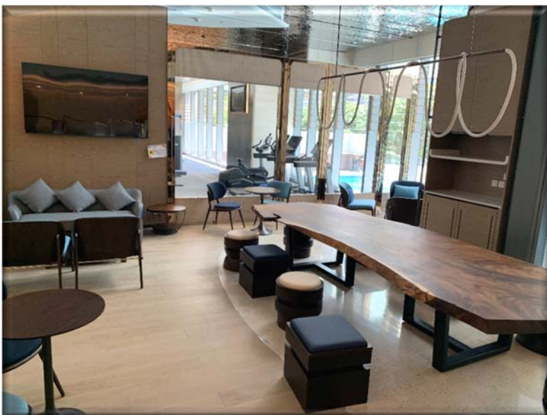
Coffee lounge features wood and homely atmosphere