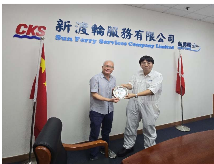
HKIMT Representative presenting memento plaque to Sun Ferry Service