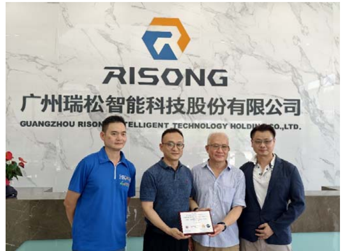
Represent HKIMT/HKJB/MMNC to present memento plaque to GDSNAME

After the morning visit, we had complimentary buffet lunch at Risong Canteen which exhibited the intelligent way of calculating total food amount collected in the Smart Tray with unique QR Code. The ancillary equipment could assist individuals' diet and cost control as per their own needs. All participants were impressed by this smart dining experience at Risong Canteen. This experience really exceeded our expectation.