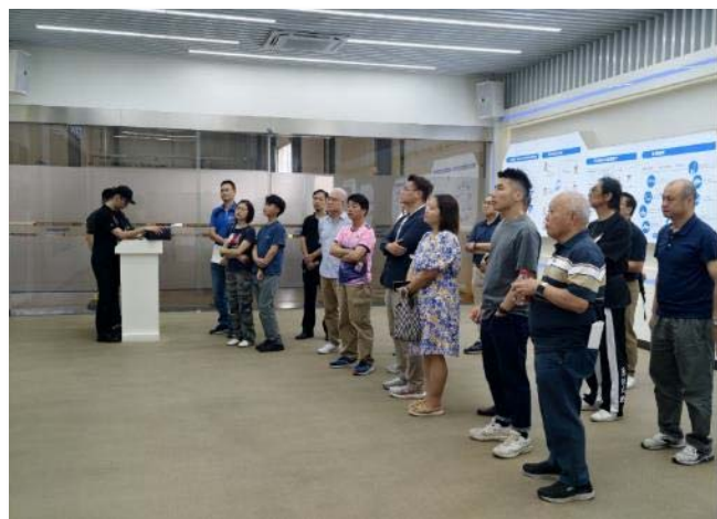
Participants in the excursion