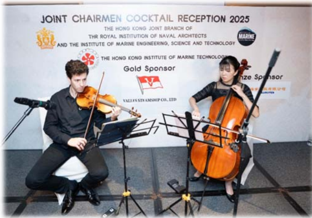
Strings Duet in Harmony