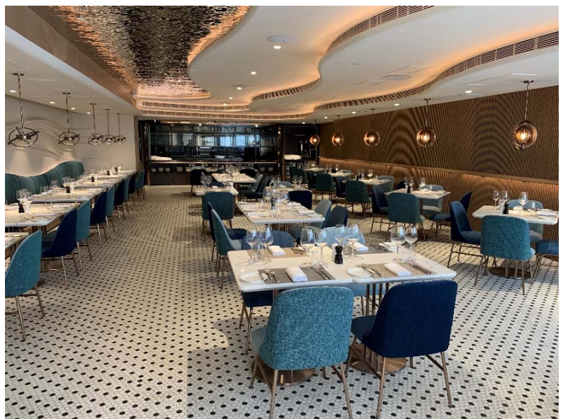
Restaurant in The Mariners

An area of seafarers' welfare is their transient accommodation. Either as joiners or leavers awaiting repatriation, they often need accommodation for a night or so in the port city. Hong Kong is a global hub of marine traffic, where crew changes take place frequently. MSHK is MtS largest operation and has involved in this ministry for 162 years. In September 2025, the fifth generation, state of the art accommodation will open to serve the seafarers again in Hong Kong after seven years of redevelopment. Occupying the lower 10 floors of the 50-storey tower in the heart of Kowloon peninsula, The Mariners will feature 75 en-suite guestrooms, a restaurant, a coffee lounge and bar, five function rooms, a gymnasium, an outdoor swimming pool and a 200 seat chapel.