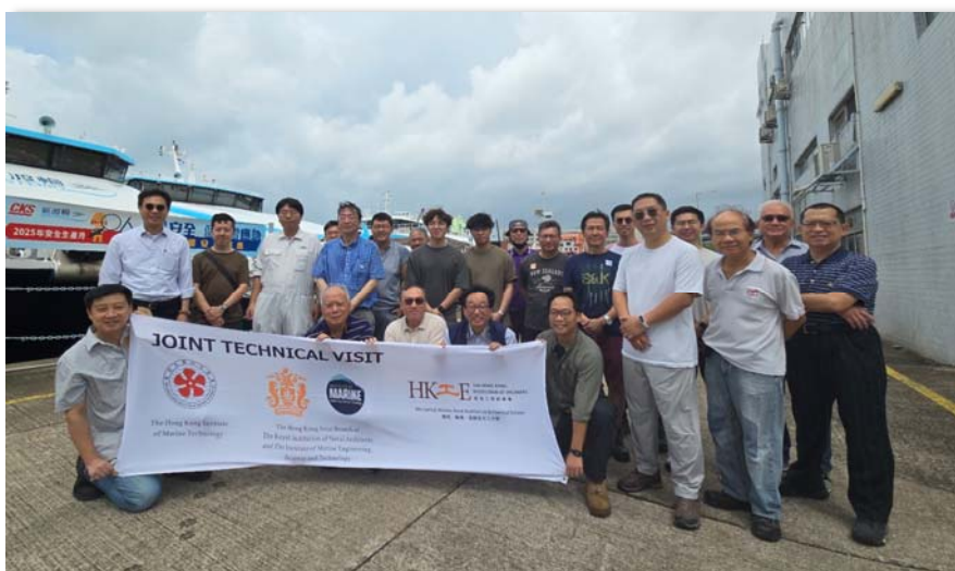
Members assembled at the Sun Ferry Shipyard